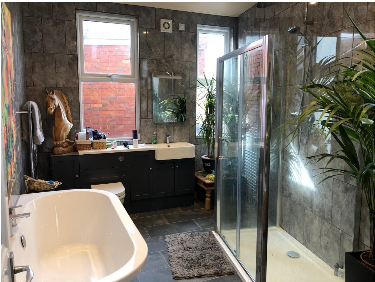
Photograph above of the bathroom within the maisonette and below of the entrance hallway.