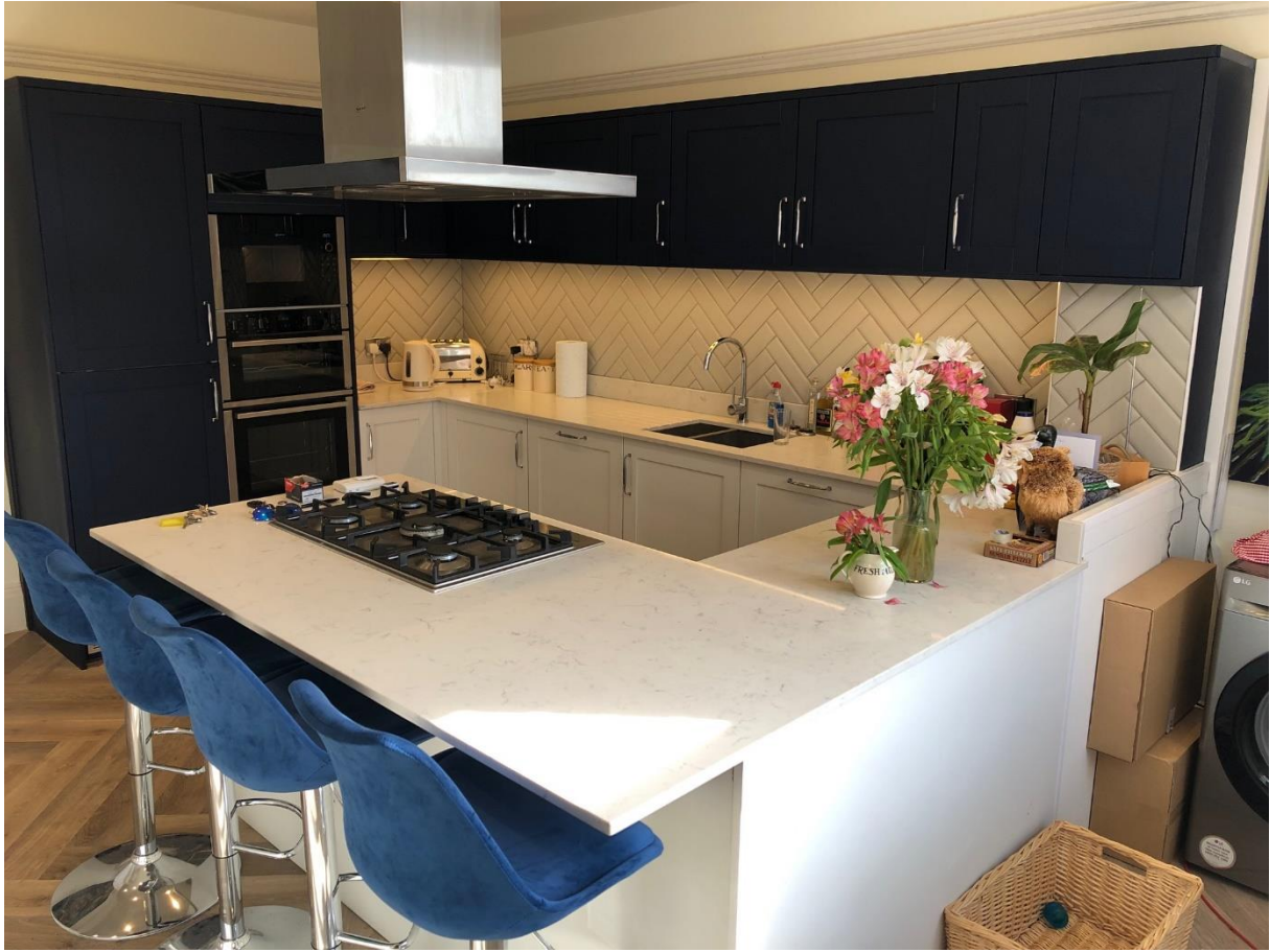
Photographs above and below of the kitchen within the maisonette.