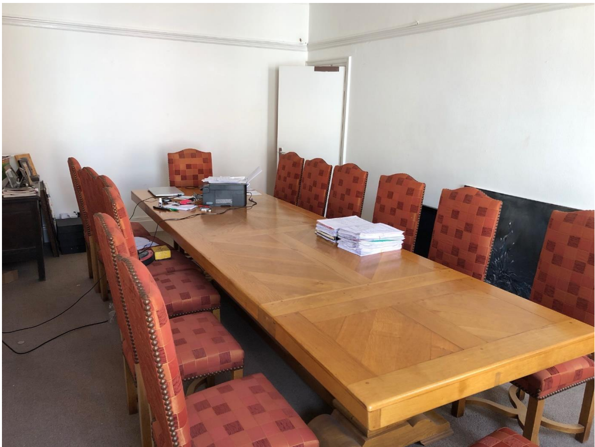
Photograph above of the dining room and below of the living room within the maisonette.